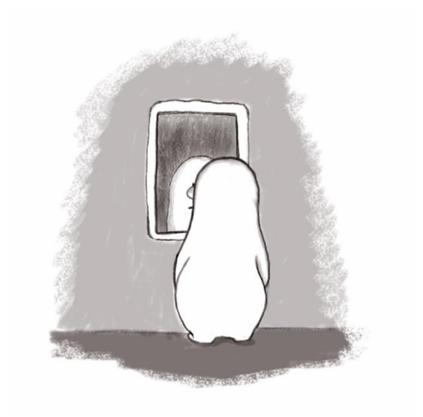
How can you help yourself?

Understand the reason for eating. Have you ever considered why we eat? In fact, there are many reasons! We eat to fuel our bodies and brains, but we also eat for pleasure—as part of our socialising as humans, to celebrate certain occasions, perhaps in response to feeling tired, sad, anxious, or happy, or just because we feel like it! All of these are valid, normal reasons for eating.