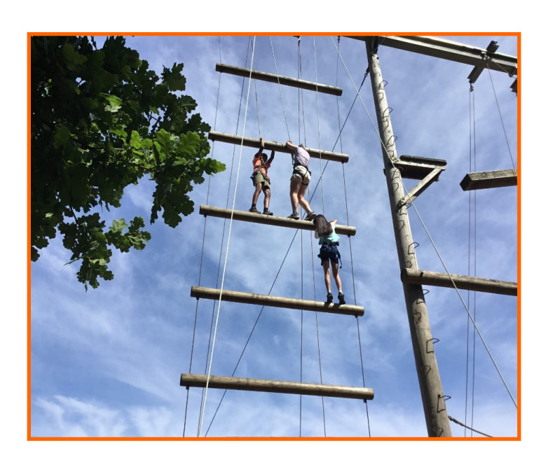
Some action shots from the obstacle course!