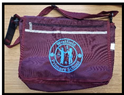
A Westfield book bag.

From September, children may bring their bags to school every day, which will be stored in the class cloakrooms, along with their coats. Due to limited space in the cloakrooms please ensure children do not bring oversized bags. A book bag is sufficient. We have separate lunch trolleys for lunch boxes.