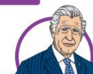
King Charles III