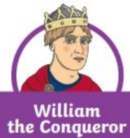
William the Conqueror