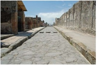
les routes romaines