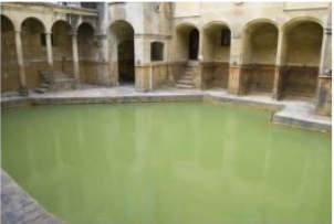
les thermes romains