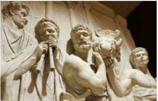
la sculpture romaine