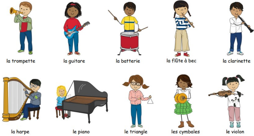
la trompette la guitare la batterie la flûte à bec la clarinette la harpe le piano le triangle les cymbales le violon