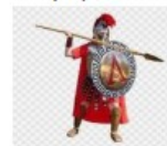
A Spartan soldier