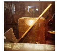
Tudor execution block and axe