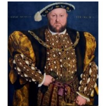
Portrait of Henry VIII