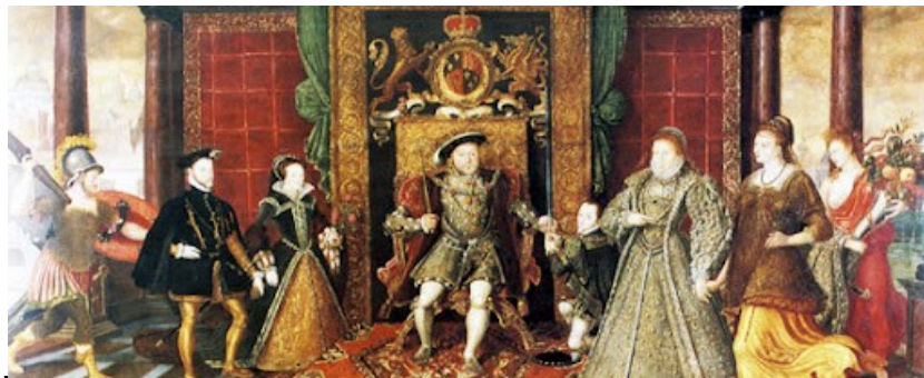
Henry VIII has close links with Woking Palace

Children will look at their local area during the Tudor period. They will understand how the landscape has changed overtime when comparing the past and present. They will gain an understanding of land use and be able to use maps to identify physical features in the locality. They will be able to compare a range of secondary sources.