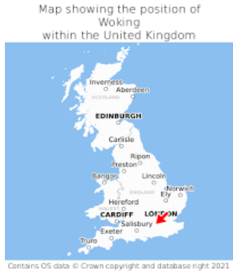
Map showing the position of Woking within the United Kingdom

Your School is Westfield Primary School.