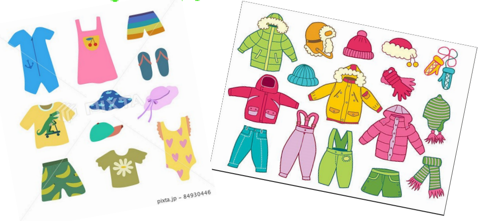
A cold country.

What have we already learnt? In reception, through stories and videos children learn about different climates and weather. This aids their understanding of differences around the world. This helps them to make a comparison between hot and cold countries in Year 1.