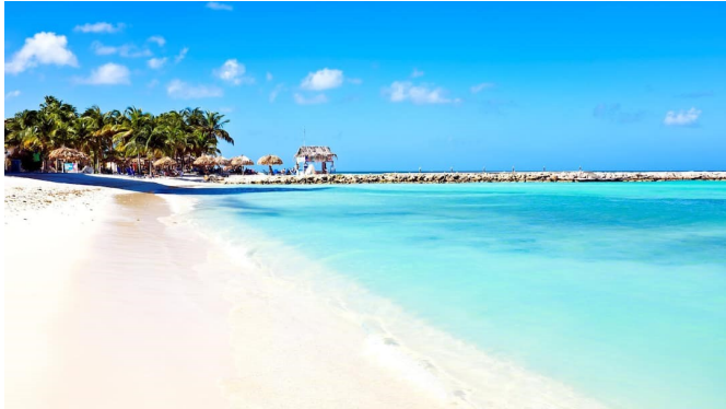
A hot country.

What have we already learnt? In reception, through stories and videos children learn about different climates and weather. This aids their understanding of differences around the world. This helps them to make a comparison between hot and cold countries in Year 1.