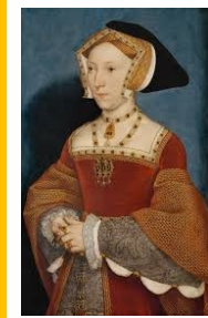
Examples of Holbein's work: